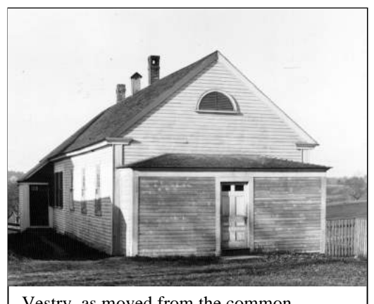
Vestry, as moved from the common.

took ten thousand fish. <sup>1</sup> A model of the Lily is on display in the Pickering Library, at the museum.