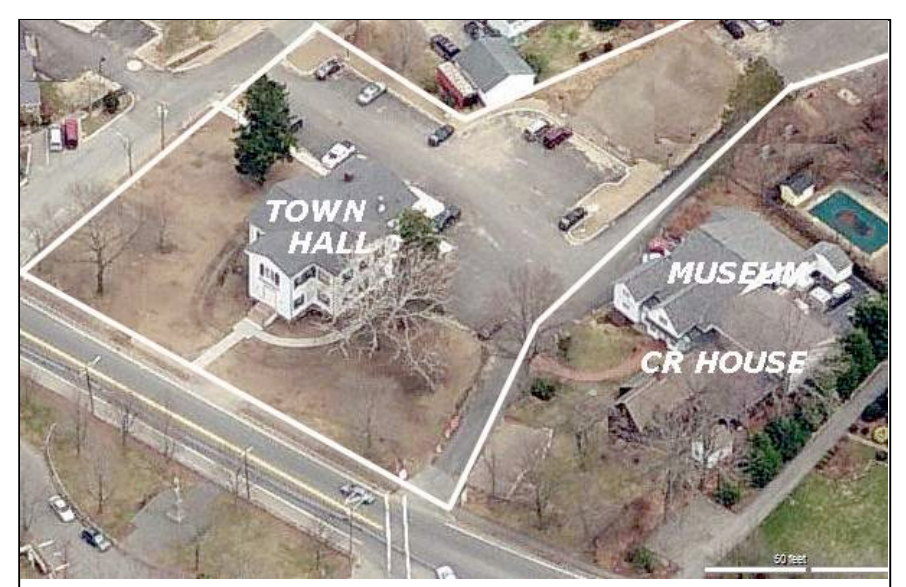
The common, in 2009, looks much different and bigger from the original militia training field of 1680.

In 1964, the town built a modern fire, police and civil defense station on the Trowt lot, adjacent to the common.