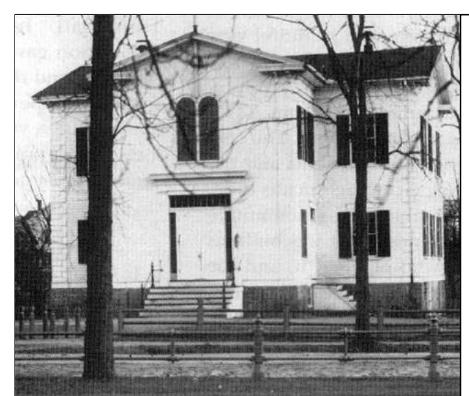
Town hall, in 1890, had a public library on the first floor. The building had been refurbished in 1874. Also, there was an iron-rail fence running around the edge of the property.