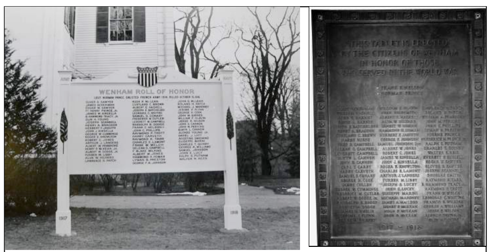
WWI veterans honor roll ( above ), formerly at front of town Hall was replaced by a plaque ( right ) placed in the town hall entry.

In 1964, the town increased the size of the WW II honor roll in order to add the names of veterans of the Korean conflict. Also, the honor roll was moved to the east side of the common near Friend Court and across from the fire station.