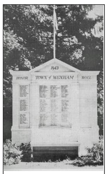
WWII veterans honor roll, formerly at front of town hall.