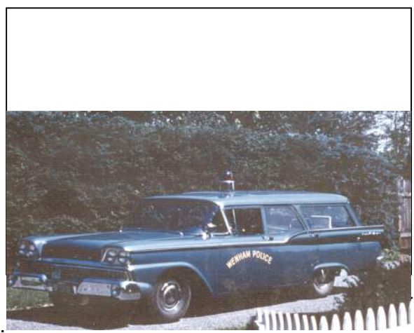
Wenham's first cruiser/ambulance was acquired in 1959.

In 1989, officers were issued automatic pistols, Glock 9mm, Safe-Action Pistol having a 15-round magazine. The department next went to the .40 cal. Glock. The new weapon, after a trade-in of the .40 cal Glock, cost $35. The complete switch to the Glock weapon was completed by 2000.