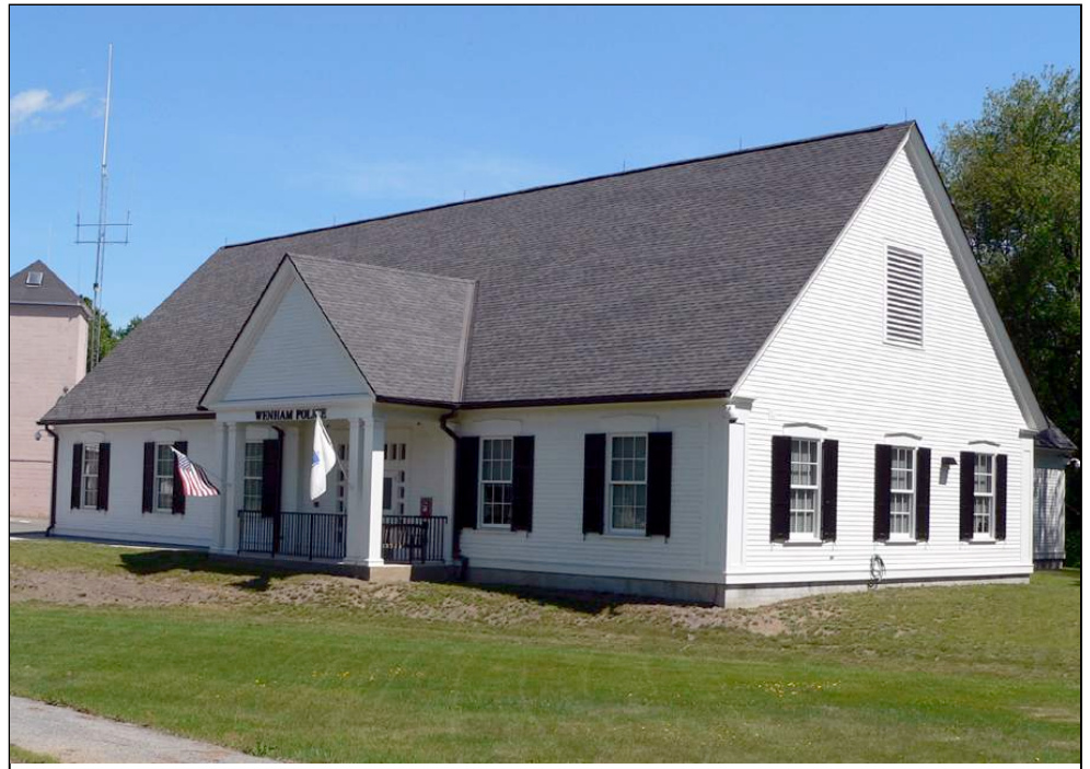
In 2007, Wenham had its first dedicated police station building.