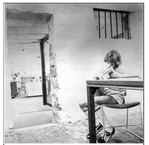
Wenham's first police station and jail were in the basement of the town hall. The cell later became a library study room.