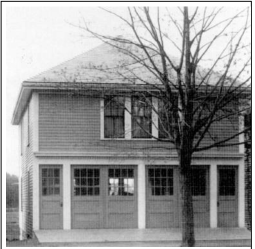
From 1959 to 1961, the police station was on the second floor of the fire station on Main St.