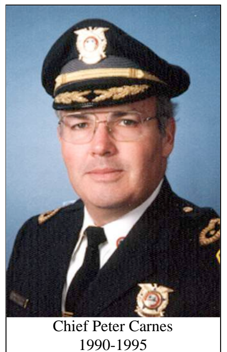
Treasures of Wenham History: Police Department