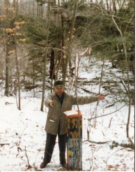
As a selectman, Dodge annually perambulated town boundaries .

1974 – A new Revenue Sharing Pol icy was of great benefit to Wenham.