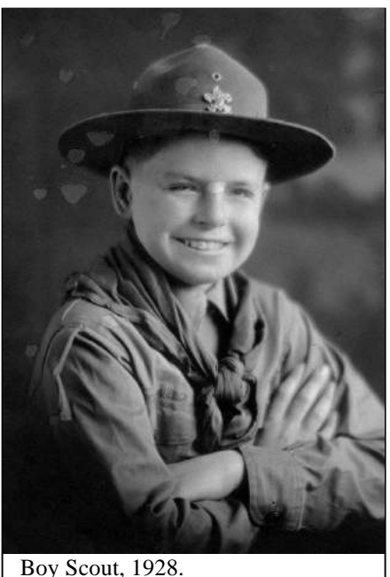
Boy Scout, 1928.