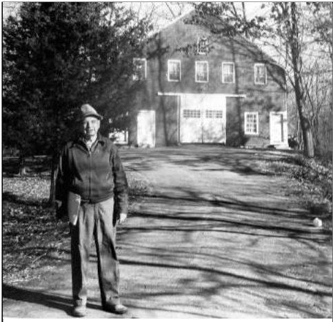
In 1975, Iron Rail barn became Boy Scouts meeting place.

It was pretty-much agreed that the junior high school students at Buker