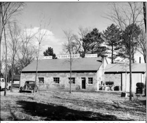
Dodge Associates garage at 268 Main St., 1948.

In its first full year of operation, 1963, the Hamilton-Wenham Regional School budget's net impact on the year's tax rate was less than four dollars.