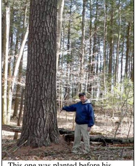
This one was planted before his time.

Windover Development purchased the property and built the senior housing development, called The Boulders.