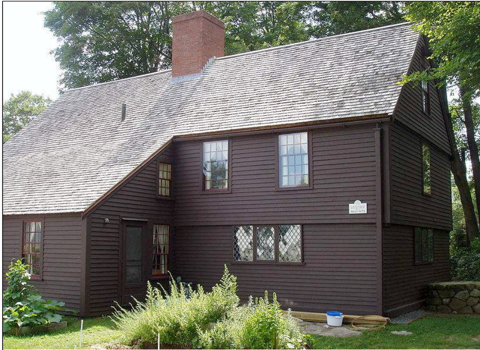
A dozen families lived in the Claflin-Richards house between 1661 and 1920.