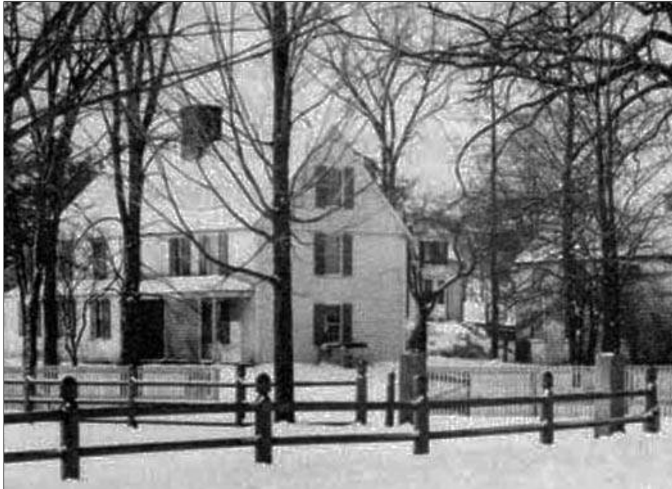
Claflin-Richards House, 1891. To the right is the Bradbury blacksmith shop and behind is the Currier house.

The sale of the Kimball property continued. On Mar. 5, 1841, Edmund Kimball, of Marblehead, sold to Mary Ann Richards "about 5 acres and 10 poles, with house barn and other buildings – thereon," for $600. 12