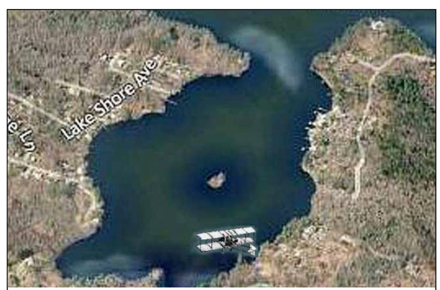
Plane took off from area near what is now boat landing and flew east about 30 feet above the ice for 120 yards.