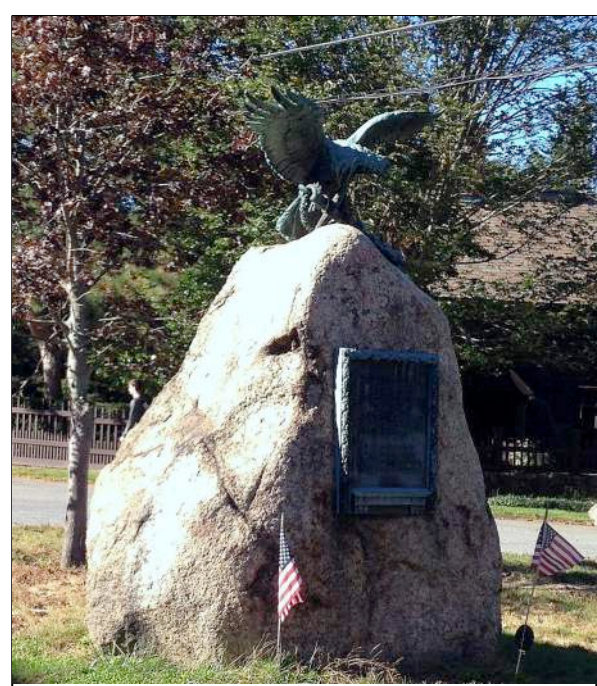
Soldiers' and Sailors' Monument erected 1924, on the small green at the front of the 1<sup>st</sup> Congregational Church house.

IN MEMORIAM ERECTED BY THE CITIZENS OF THIS TOWN IN HONOR OF HER PATRIOTIC MEN AND WOMEN WHO SERVED THEIR COUNTRY IN TIME OF WAR TO THE DEAD. A TRIBUTE TO THE LIVING. A MEMORY TO POSTERITY. AN EMBLEM OF LOYALTY TO THE FLAG OF THEIR COUNTRY."