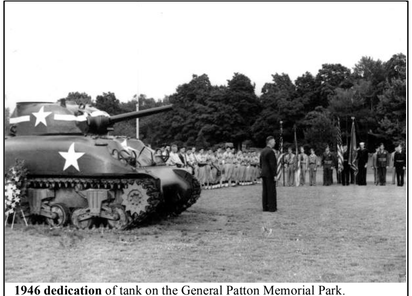
1946 dedication of tank on the General Patton Memorial Park