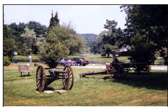
1955 A civil war and a WWI cannon were transferred to Patton Park from the Memorial Green and placed near the Bay Road entrance.