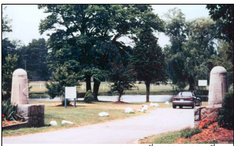
Markers, from 2 French towns, honor 83<sup>rd</sup> Division of the 3<sup>rd</sup> Army and the 4<sup>th</sup> Armored Div., led by Gen. Patton's attack against the Germans.