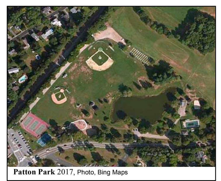
History of ...

In 1910, a major fire that began on Mill Street spread to the east, reaching the Main Street ( now Bay Road ) and Asbury Street area. It destroyed all the buildings at this intersection, including widow Hattie A. Pearson's house and barn, on the north corner of Main St. and Asbury St. <sup>1</sup>