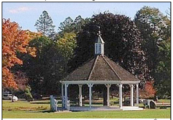
1994 Bandstand built. The first concert was on Jul. 4<sup>th</sup>. Handicap access, left, was added later.

A dozen pits, 48-ft. long and 6 ft. wide were laid