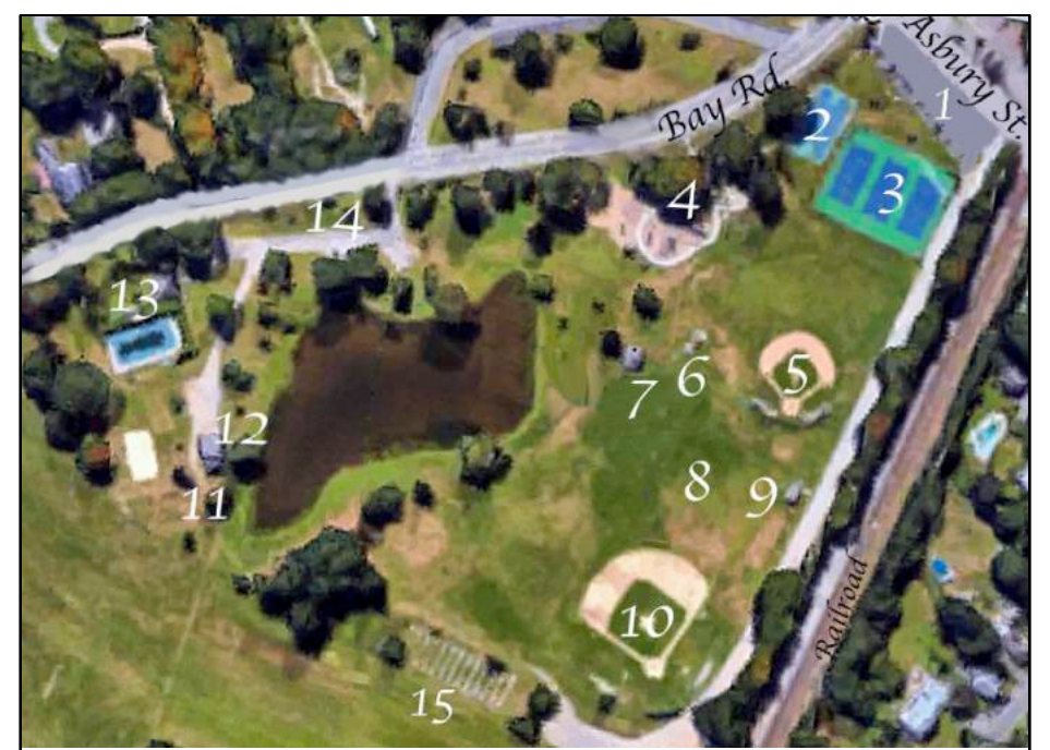
Patton Park, 2018 – 1) Parking lot; 2) Basketball; 3) Tennis; 4) Playground; 5) Little League; 6) Bandstand; 7) Tank; 8) Football; 9) Toilets; 10) Baseball; 11) Garage; 12) Picnic; 13) Pool; 14) Parking; and 15 Horseshoes. Photo, Google maps, 2017