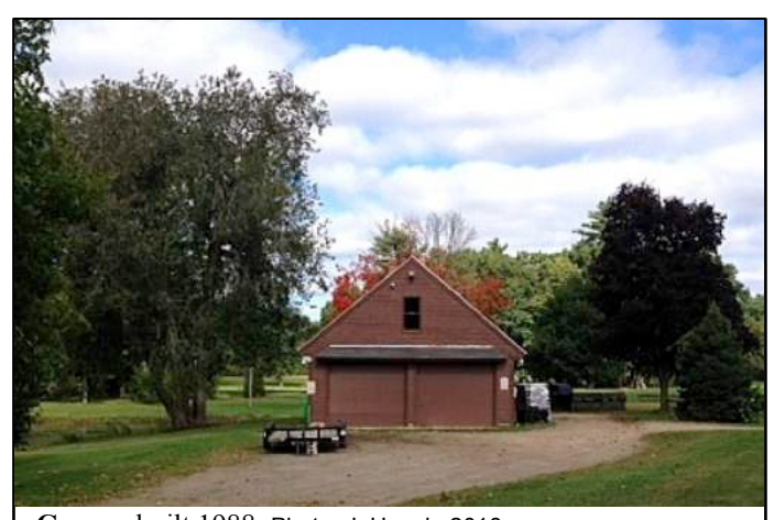
Garage built 1988. Photo, J. Hauck, 2018