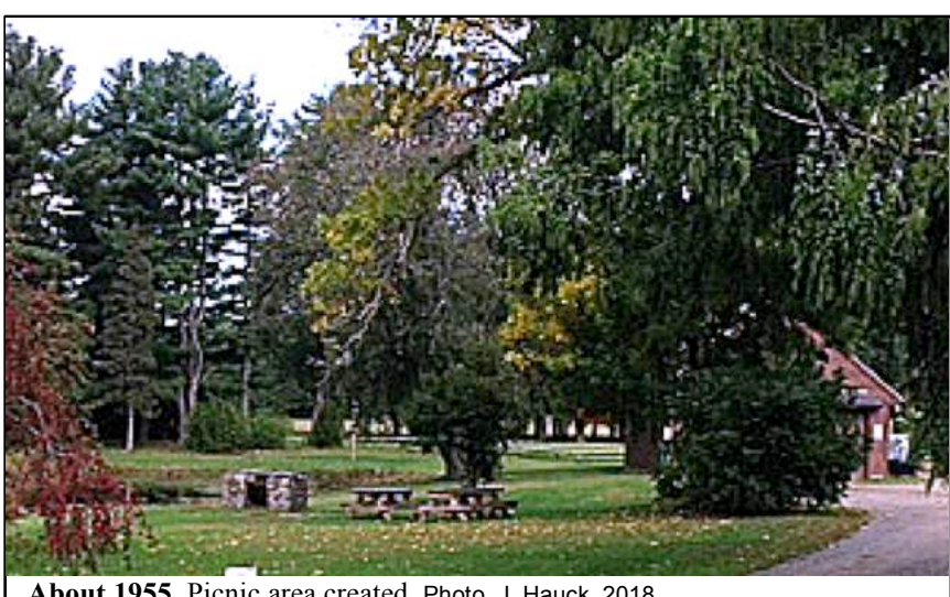
About 1955, Picnic area created.