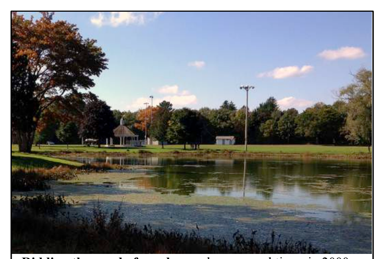
Ridding the pond of weeds was done several times in 2000s.. Weed regrowth followed each effort. Photo, J. Hauck, 2014

In 2009, citing the need to update Patton Park's Summer Park program, to reflect the changing needs to the community, the Recreation Department began offering an outdoor movie night. The first movie, Shrek, was shown in July. <sup>37</sup> None of the swamp creatures came out from the weed-filled Weaver pond to watch the movie.