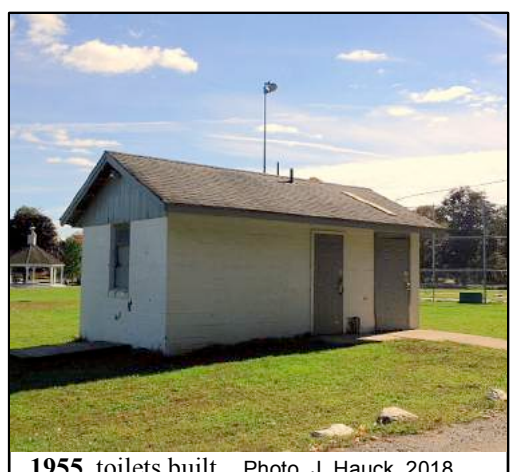
1955, toilets built . Photo, J. Hauck, 2018