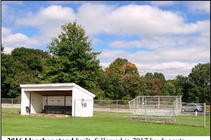
2016 bleacher stand built, followed in 2017 by dugouts.