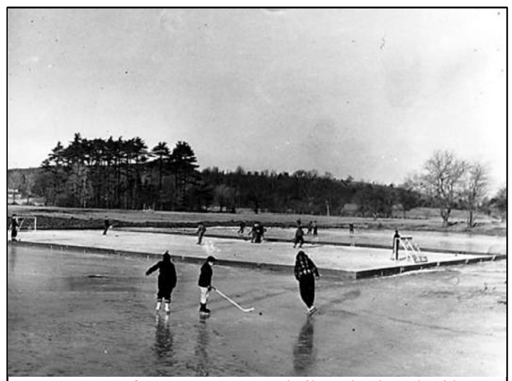
Hockey rink, for many years, was built each winter beside Weaver Pond.