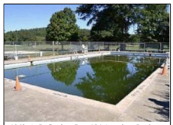
1962, A. P. Gardner Post 194 American Legion gave the town a swimming pool.