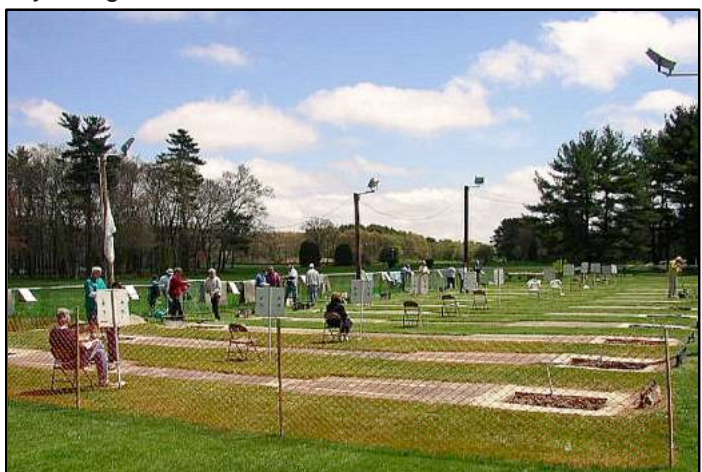
Horseshoe pits , a dozen, built in 1995, are on the north side of the park.

In 2013, Hamilton fielded, at Patton Park, a New England Flag Football League team. <sup>38</sup> Instead of tackling, the defensive team pulls a flag from the waist of the ball carrier. Contact is not allowed between players. In the New England League, teams have 5 active players, up to 13 years old. There are both girls and boys leagues.