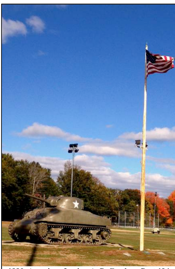
1990, American Legion A. P, Gardner Post 194 provided a concrete slab for the 33-ton Sherman tank.