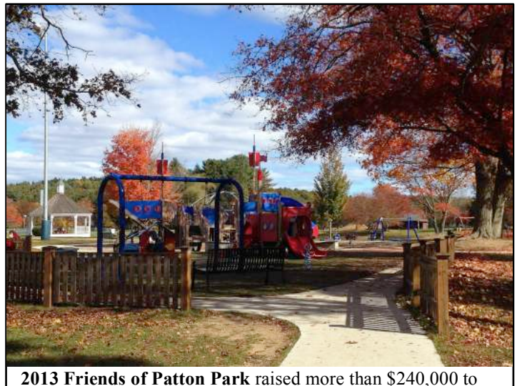
2013 Friends of Patton Park raised more than $240,000 to buy and install the new equipment . Photo, J. Hauck, 2017