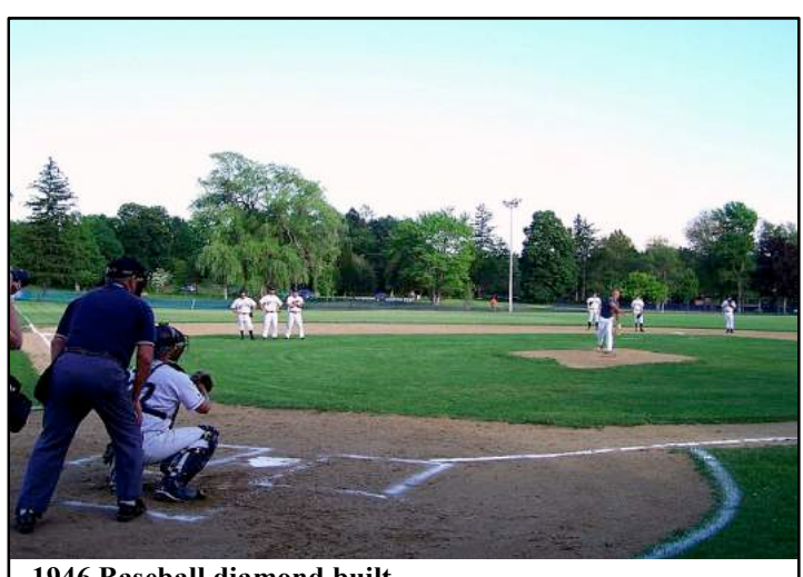
1946 Baseball diamond built .