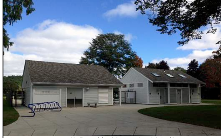
Service building ( left ) and bathhouse ( right ) built 2017. Photo, J. Hauck, 2018