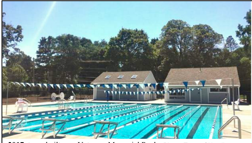
2017, town built new Veterans Memorial Pool.