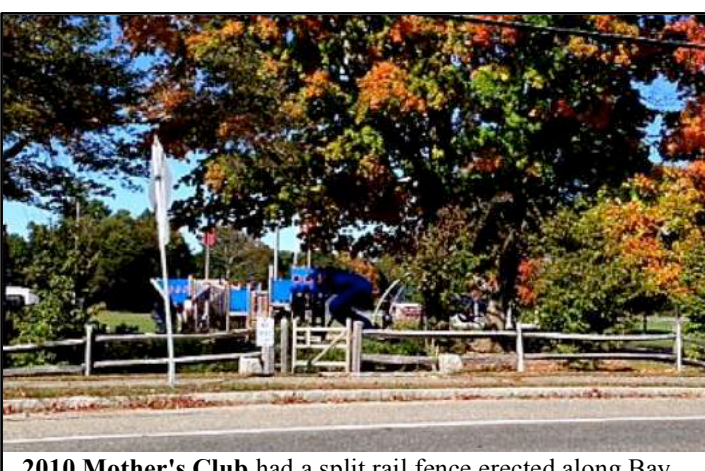
2010 Mother's Club had a split rail fence erected along Bay Road. The attractive addition also restricts children from running onto the road.