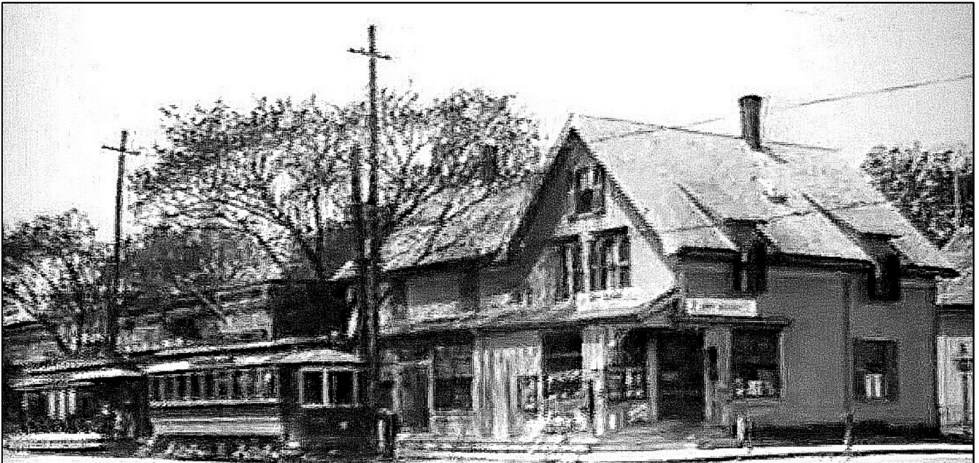
Streetcar station and waiting room was in the variety store at corner of Main St. and Railroad Ave.