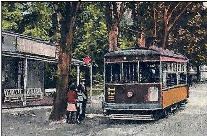
Asbury Grove station was close to the front of the Methodist campground on Asbury Street. Cars ran on the hour.

Many of the people from Beverly to the Asbury Grove station were not going to the Grove for religious services: some were cutting through the Grove to reach Idlewood Lake. A perimeter path, Sunnyside Ave., connected the Grove to Idlewood Lake. At the end of Sunnyside, there was a path, with