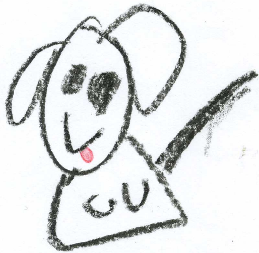
Pippi Doodle and Her Friend