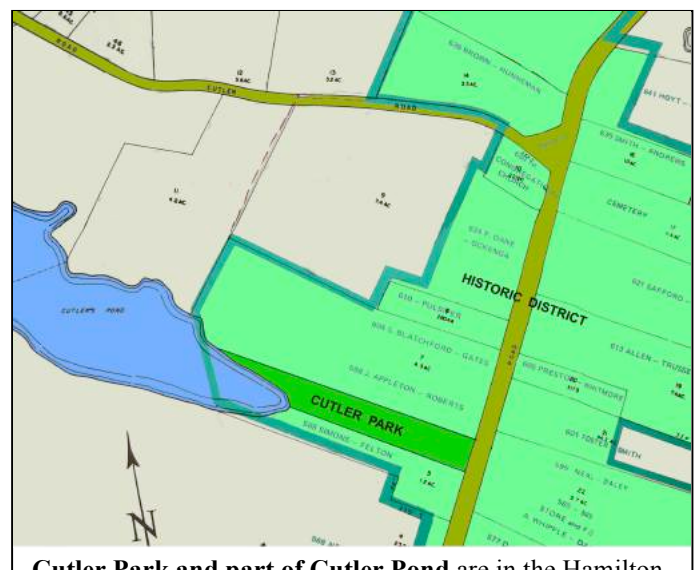
Cutler Park and part of Cutler Pond are in the Hamilton Historic District.

The 1935 Salem News article also had this to say of the park, "To those, who like to stroll in the attractive pine grove or sit quietly on one of the rough benches, placed at intervals about the grounds, it offers a delightful setting for just such a reverie." <sup>2</sup> The name change from Central Park to Cutler Park occurred during the 1937 Northwest Territory Celebration in Hamilton. <sup>6</sup>