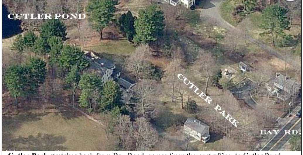
Cutler Park stretches back from Bay Road, across from the post office, to Cutler Pond.

The Commission investigated the purchase of the Wigglesworth Cemetery, which had a frontage on Main Street of 84 ft. They contacted the descendants of the origi-