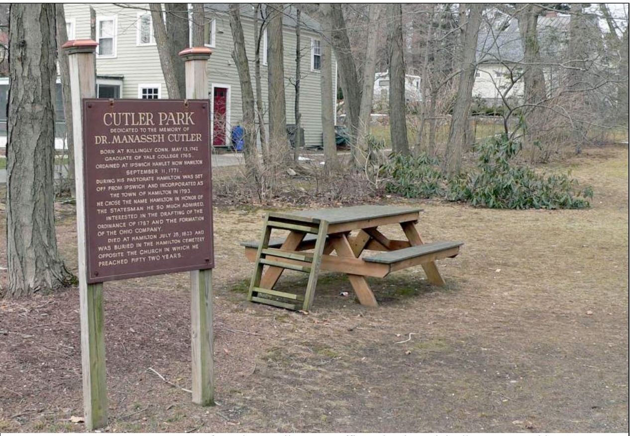
Cutler Park is on Bay Road , across from the Hamilton post office. The sign originally was erected in 1937, when the park name was changed from Central Park to Cutler Park. Photo, J. Hauck, 2013.