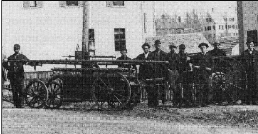
Fire company standing with Enon 1, 1897. Fire house was just to the right.

For all of the 1600s and 1700s, there were no fire departments. This, being near a source of water, a creek or pond, was very important fire insurance. important fire safety insurance.