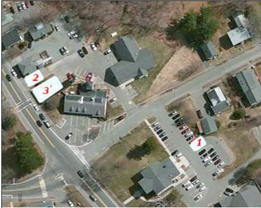
Wenham common, showing: 1) first engine house, built 1836; 2) second engine house, built 1849; 3) third fire station, built 1901; and 4) current fire station, built 1964. (Adapted from Bing Maps)