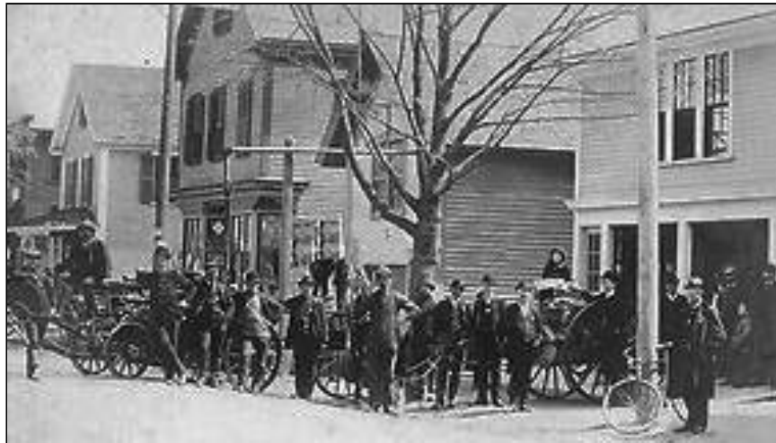
Members of the Board of Fire Engineers, formed in 1908, stand with equipment in front of second fire station ( right ). (Photo, 1909 post card)

The selectmen also approved $100 to build an engine house and purchase necessary apparatus. David Starrett and Jabez Richards were given responsibility for building the engine house and finding a suitable location for its erection. 31