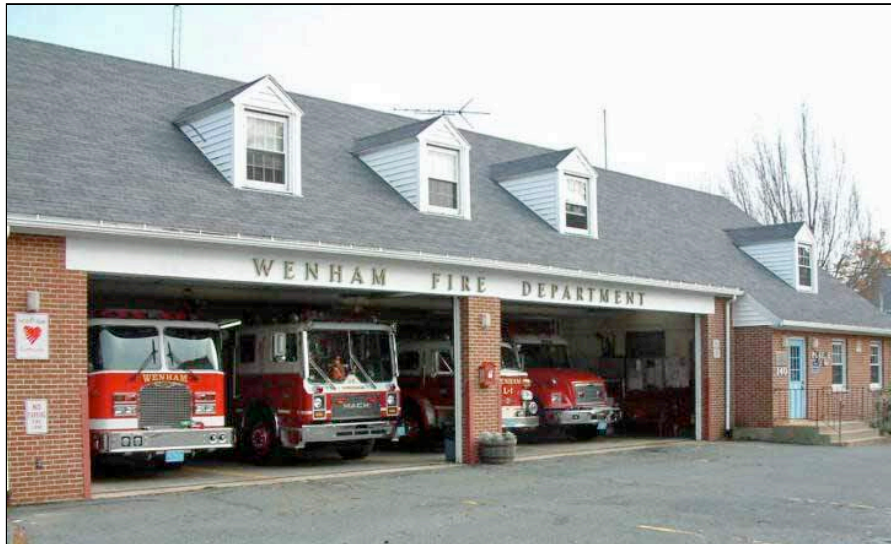
3 rd fire station built in 1964. It also included the police station.

emergency medical dispatch. The EREC is centered at the Essex County Sheriff's Department, in Middleton. 39