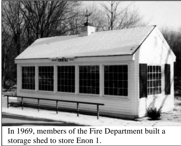
In 1969, members of the Fire Department built a storage shed to store Enon 1.